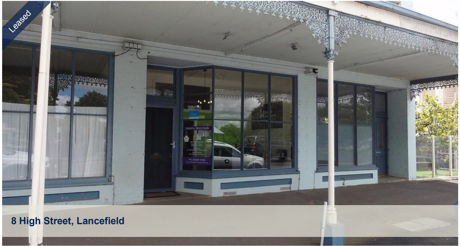
8 High Street, Lancefield