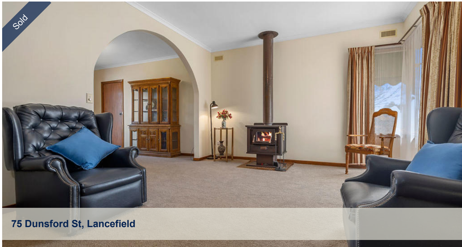
75 Dunsford St, Lancefield