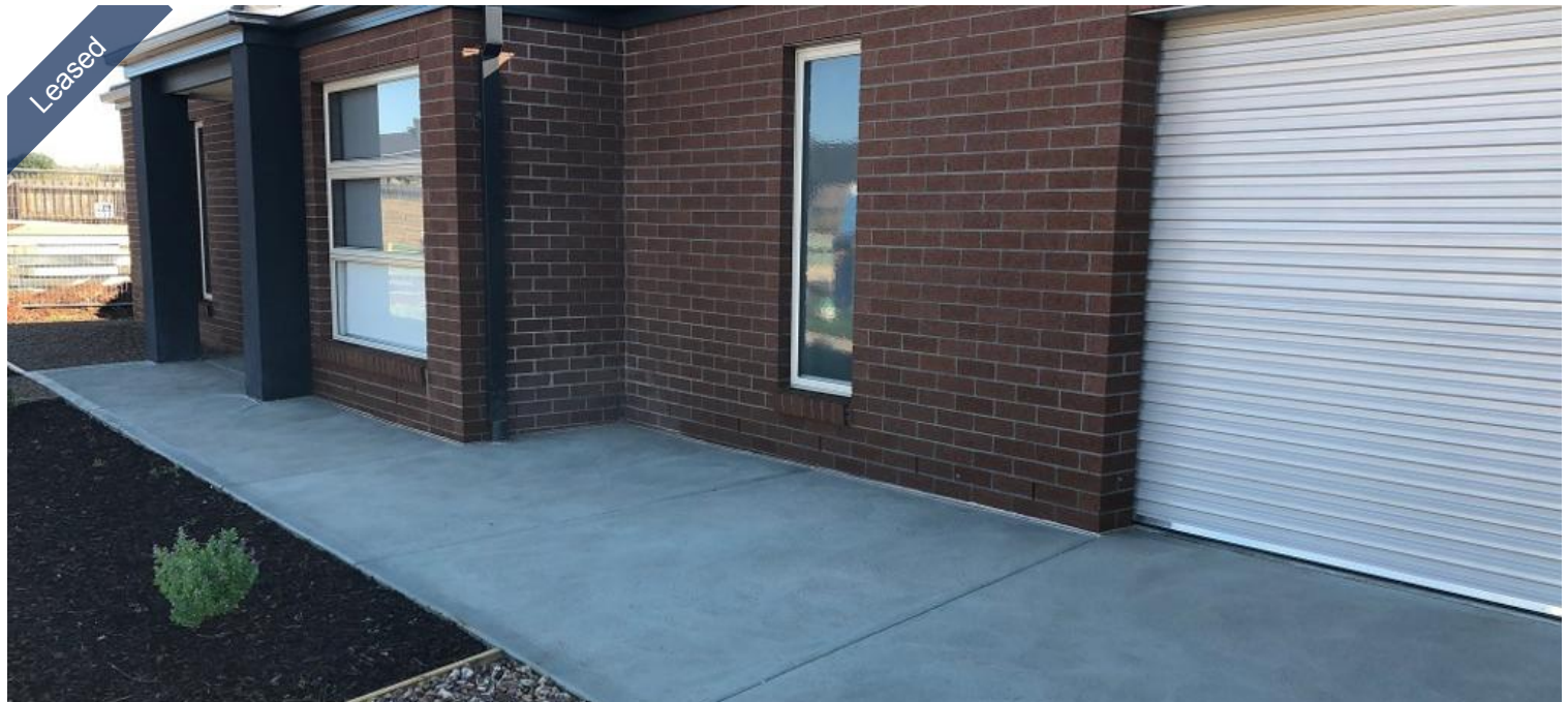
11 William Court, Lancefield