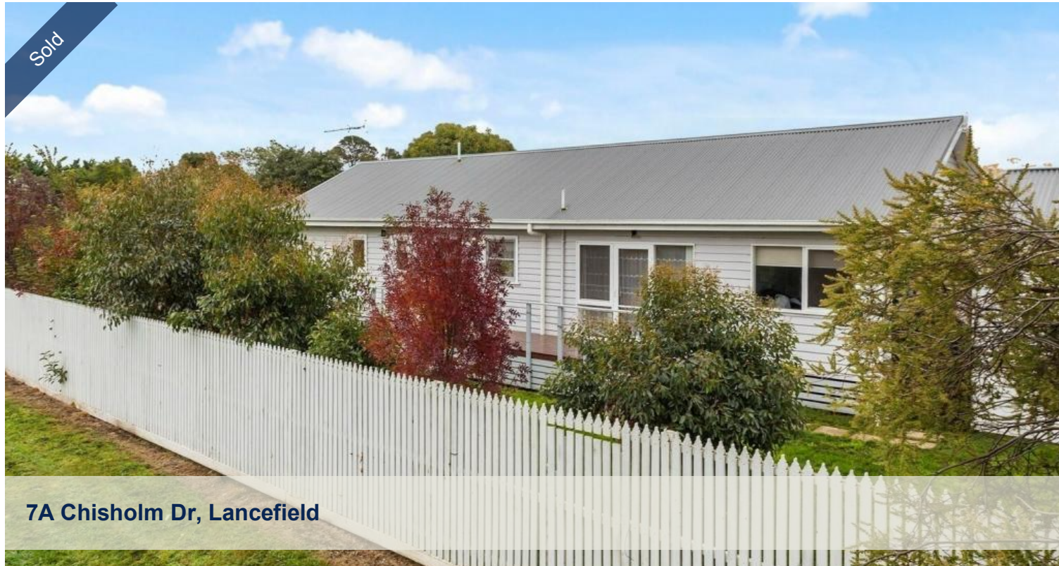
7A Chisholm Dr, Lancefield