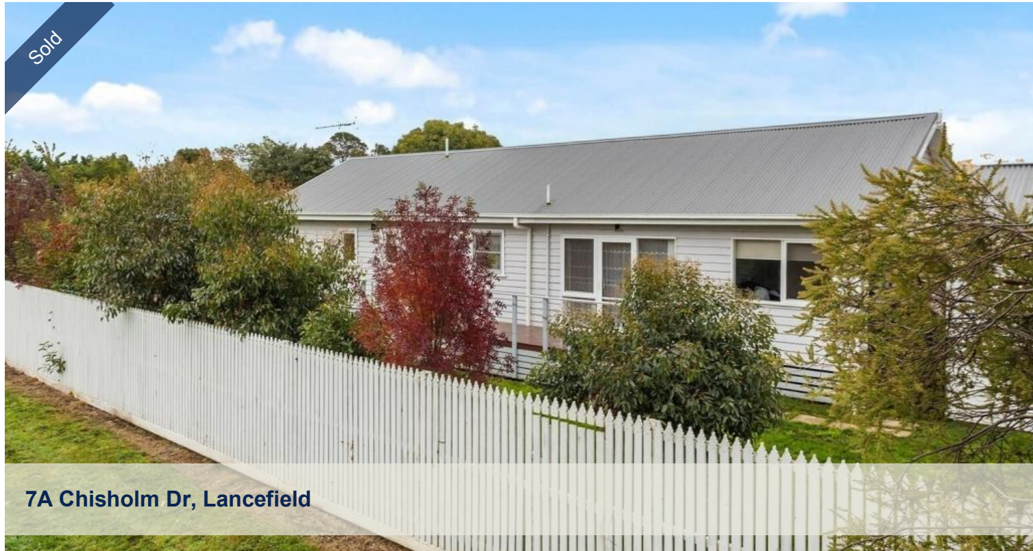
7A Chisholm Dr, Lancefield